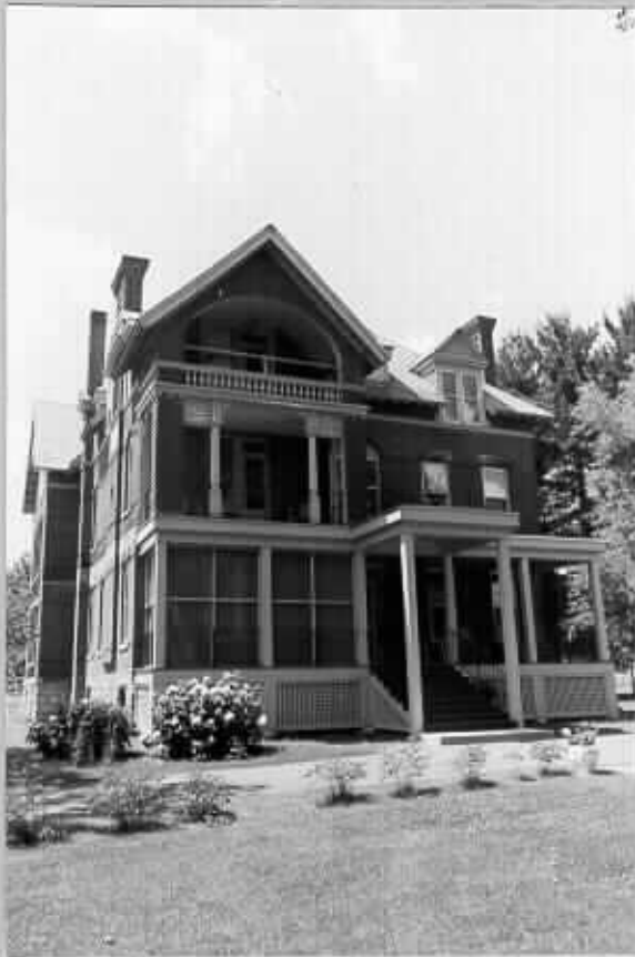
FRONT (EAST) FACADE LOOKING WEST

* 1 storey shed-roof clapboard addition at rear.