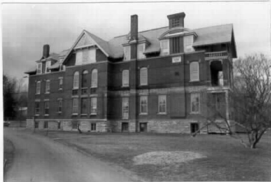
SOUTH FAÇADE, LOOKING NORTH

PLATTSBURGH CITY MULTIPLE RESOURCE AREA S.F. VILAS HOME FOR AGED & INFIRMED LADIES N.W. CORNER BEEKMAN AND CORNELIA STS. CLINTON COUNTY PLATTSBURGH, NY