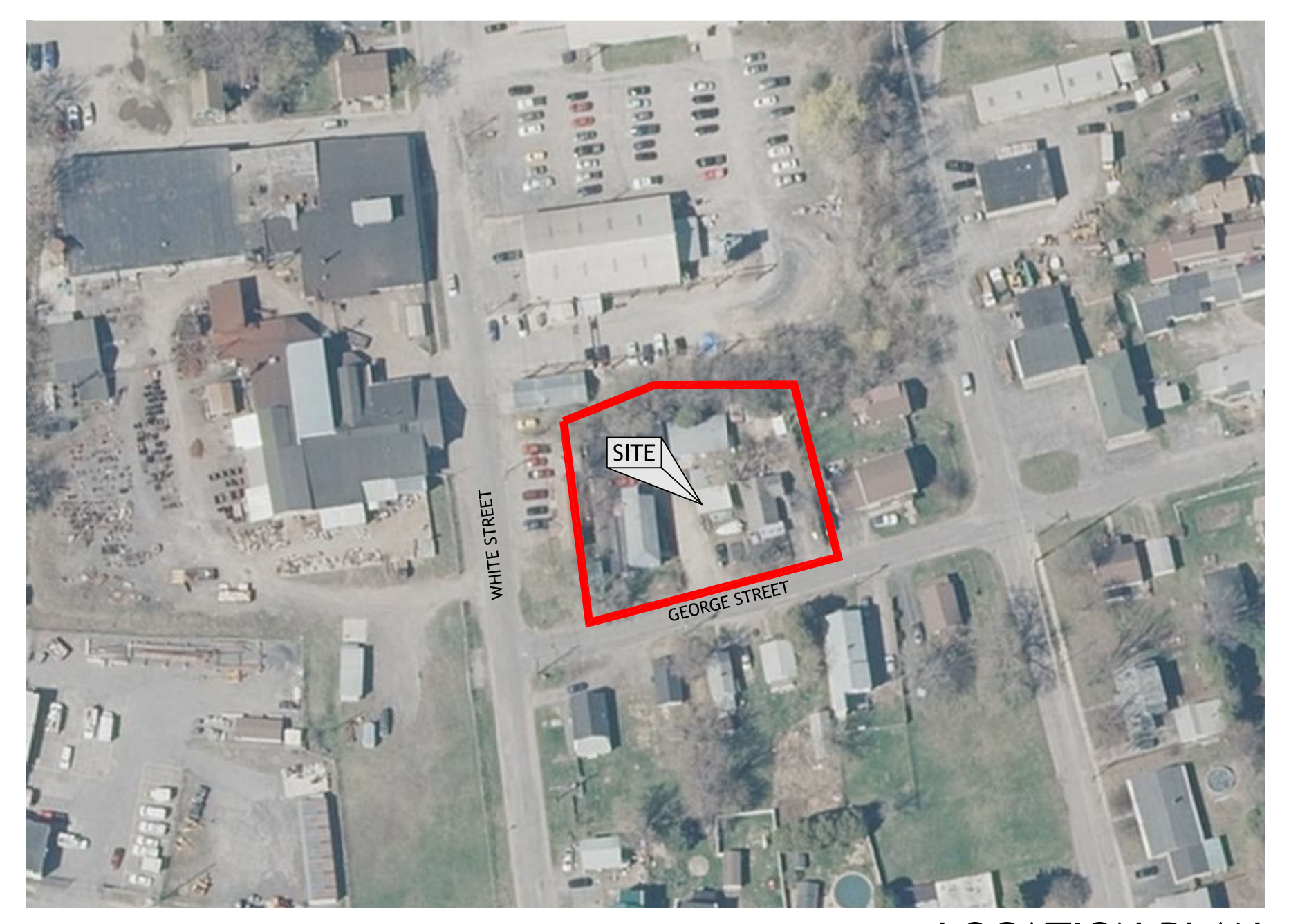
LOCATION PLAN SCALE: 1" = 80'