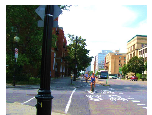
Incorporated complete streets concepts to the extent practicable as this helps make the city increasingly livable and attractive for both current and prospective residents. (Example image Montréal, Quebec)