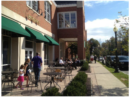
Incorporate traditional elements and streetscape with generous spaces and amenities for pedestrians. (Example from Pittsford, NY)