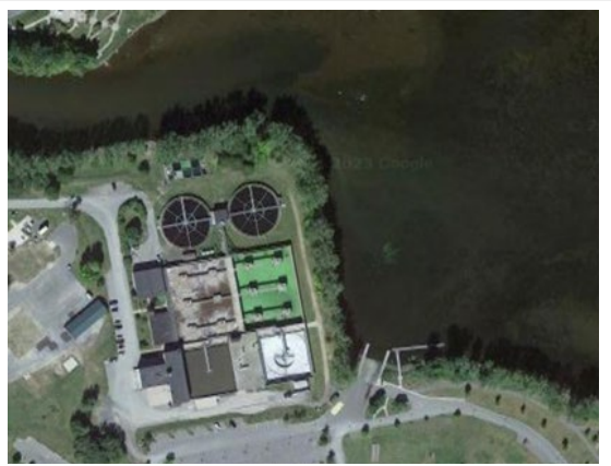
Pollution prevention to maintain water quality is an important water-dependent use performed at the City's treatment facility located at the mouth of the Saranac River.