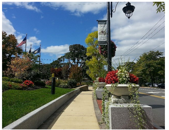
Accommodation for pedestrians, accessibility, land landscape buffers between vehicle travel lane, sidewalk and parking area. ( Image example New City, NY )