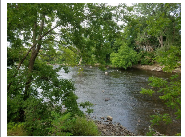
The Saranac River is Plattsburgh's natural link to the Adirondacks—maintain vegetative cover along shorelines and riparian edges as vital element for the health of waterways. (Example from Plattsburgh, NY)