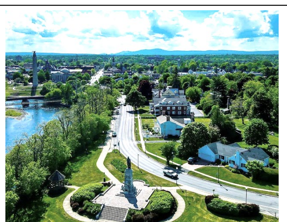
Include pedestrian amenities and civic spaces—these provide a source of local pride of place—and establish a benchmark of quality for design. (Example image Plattsburgh, NY)