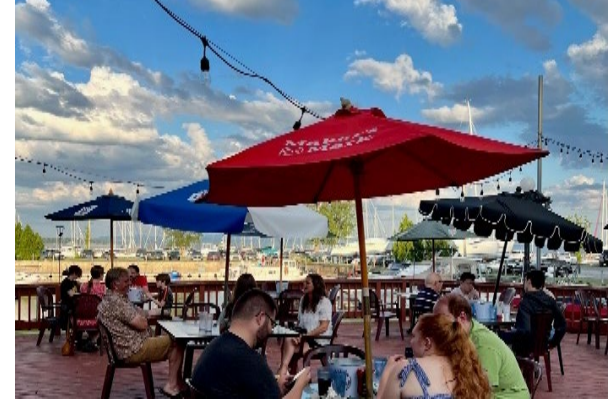
Provide amenities and spaces for people to enjoy the beauty of the waterfront area. (Example from Plattsburgh, NY)