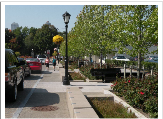
Incorporate natural processes as "green infrastructure" in design of stormwater management facilities. (Example from Niagara Falls, NY)