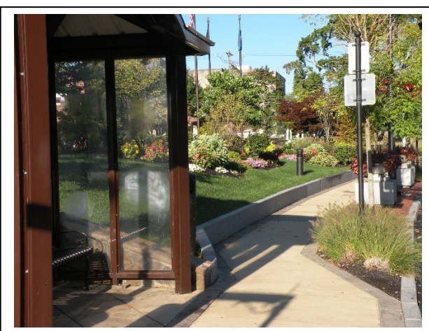
Incorporate urban pocket parks and landscape plantings, accommodating sidewalks, transit shelters and other pedestrian amenities into redevelopment plans. (Example from New City, NY)