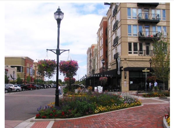
Provide public spaces that prioritize the pedestrian environment and offer attractive architectural and landscape architectural elements. (Example from Aspen, CO)