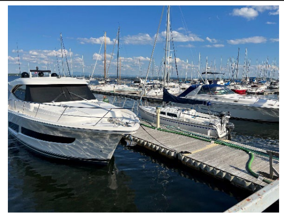
The Marina at Plattsburgh Boat Basin is a water-dependent use that provides important access to Lake Champlain and as a waterfront gateway to the City.