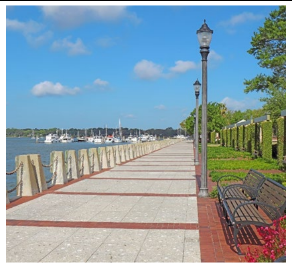
In this example, a more traditional set of materials and design elements were utilized. In either case, the promenade provides important public access to the waterfront. (Example from Beaufort, SC)