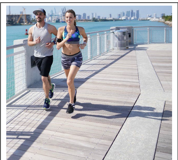
Waterfront design character responsive to the setting and community vision—in this example, a sleek and modern approach was appropriate to the setting. (Example from Miami, FL))